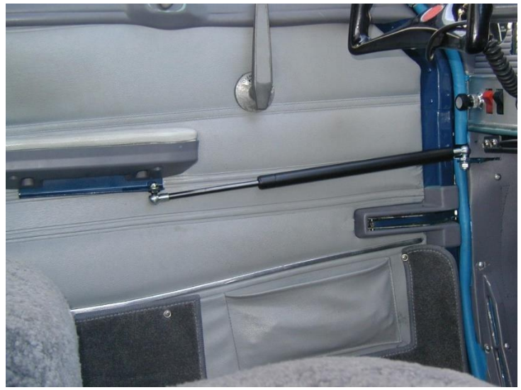
Figure 4. Installation Complete - Door Closed

16. Install the tube end of the gas spring onto the airframe bracket ball stud and install the safety clip (P/N MVA-9002). On the left hand door installation it is easier to snap the uninstalled ¼"-20 ball stud (P/N MVA-9004) into the rod end of the gas spring, insert the safety clip and then put the ball stud shank through the door bracket slot from the bottom. Add a washer and then the self-locking nut. Do not tighten the nut down until you establish the full open position, which should be just as the factory door stop reached its full open position. It is best if the gas spring reaches full open just prior to the original stop location so that in a tailwind open situation the gas spring will have already slowed the door down when it arrives at the original factory stop. Tighten the nut to 40-50 in. lbs.