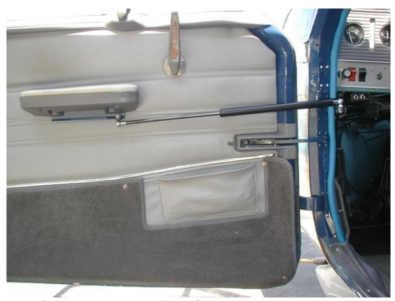
Figure 5. Installation Complete - Door Open